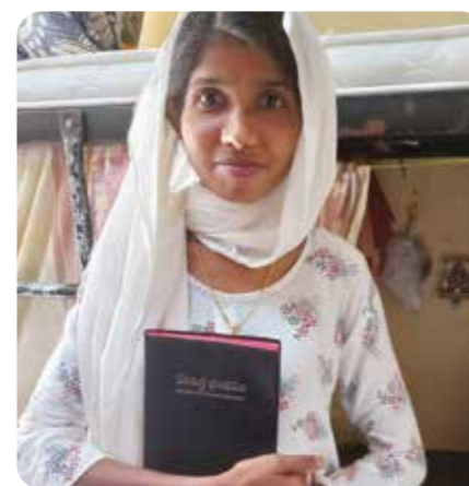
This migrant worker was delighted to receive a Bible in the United Arab Emirates.

What is not in doubt at all is that many migrant workers, who are usually impoverished and go there to earn money, end up living and working in extremely poor conditions. During the pandemic a lot of them lost their jobs and found it impossible to support their families.