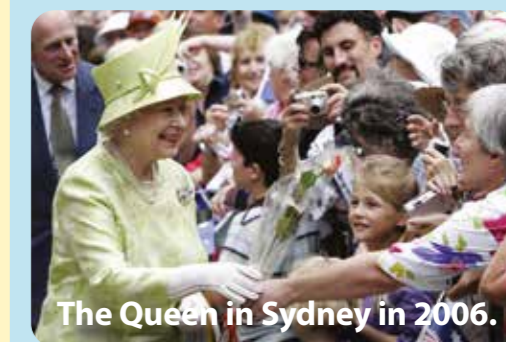
The Queen in Sydney in 2006.