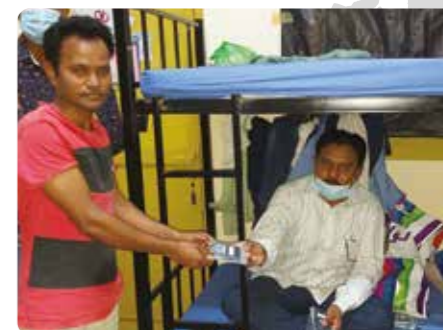
Thanks to your support, Bibles are regularly distributed in the cramped quarters of migrant workers in the Gulf.