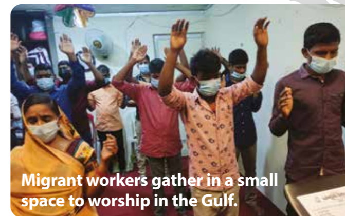
Migrant workers gather in a small space to worship in the Gulf.