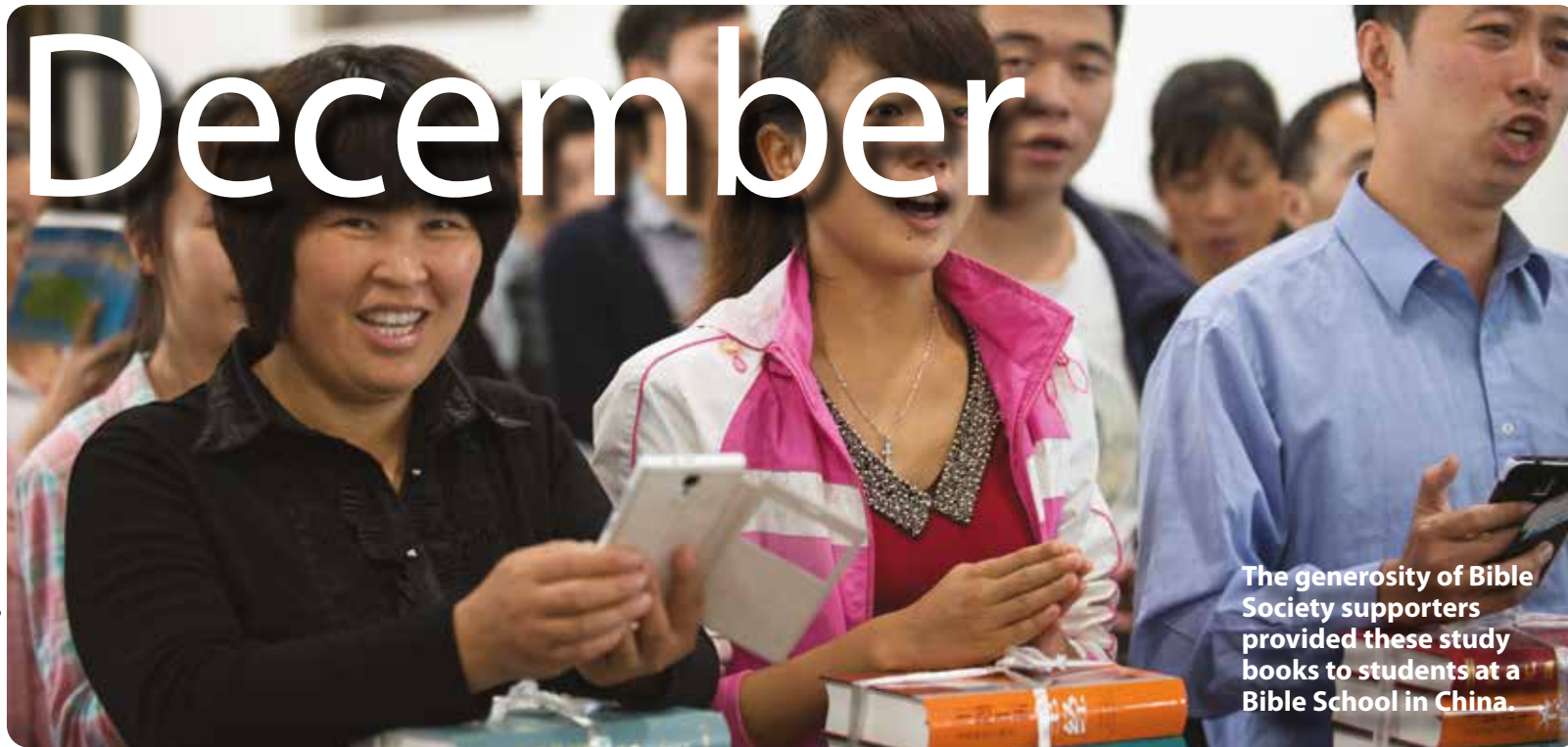
The generosity of Bible Society supporters provided these study books to students at a Bible School in China.

It has been difficult for Bible mission in China recently, not least because whole cities continue (at the time of writing) to be locked down due to Covid, thus hampering Bible work in churches. Please join us in praying that Bible mission will get back on track in China and also pray for Bible Society's flourishing work with the Chinese Church in England and Wales.