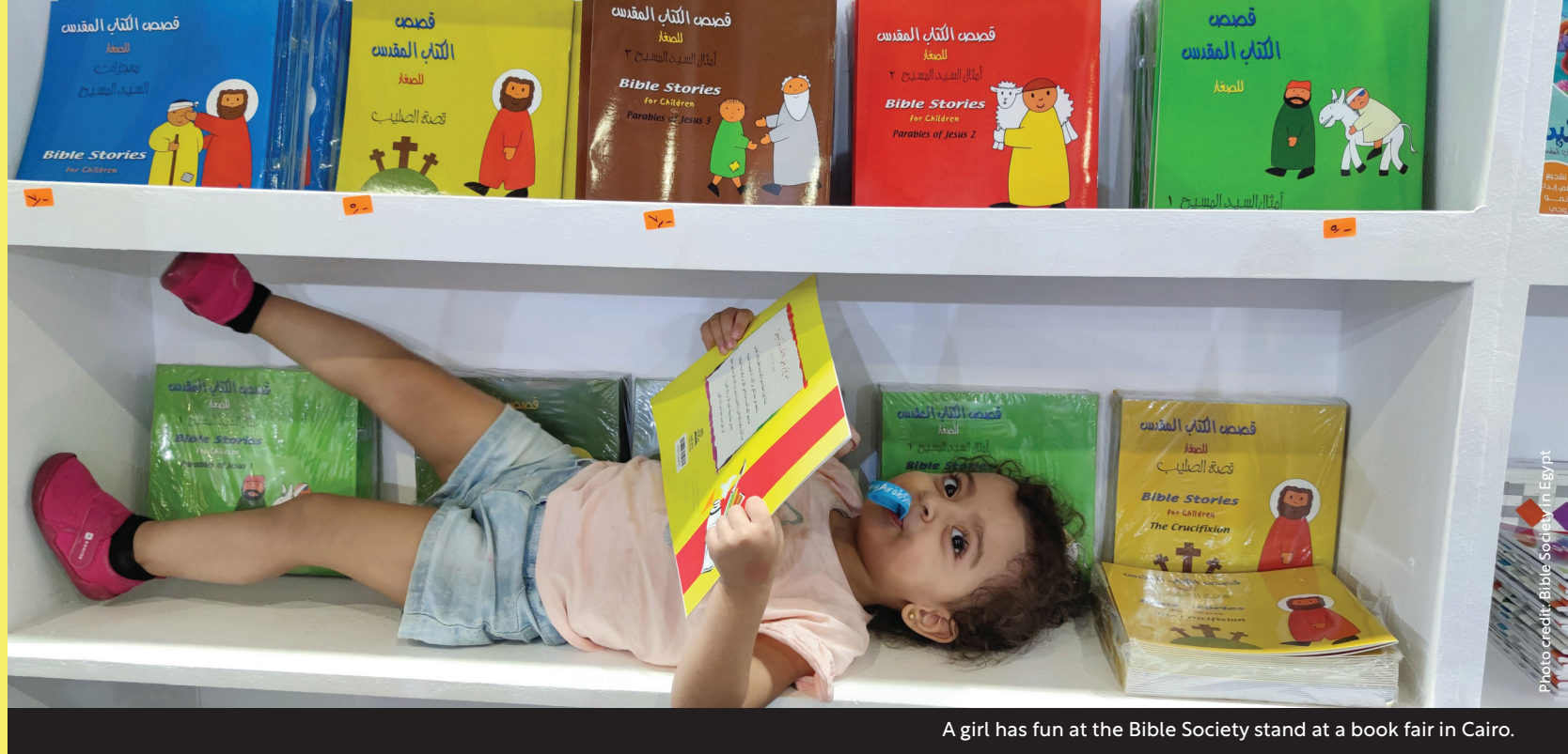
A girl has fun at the Bible Society stand at a book fair in Cairo.

But the word of God increased and multiplied. ACTS 12.24 (ESV)